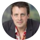
Oliver Bullough Author of Moneyland United Kingdom